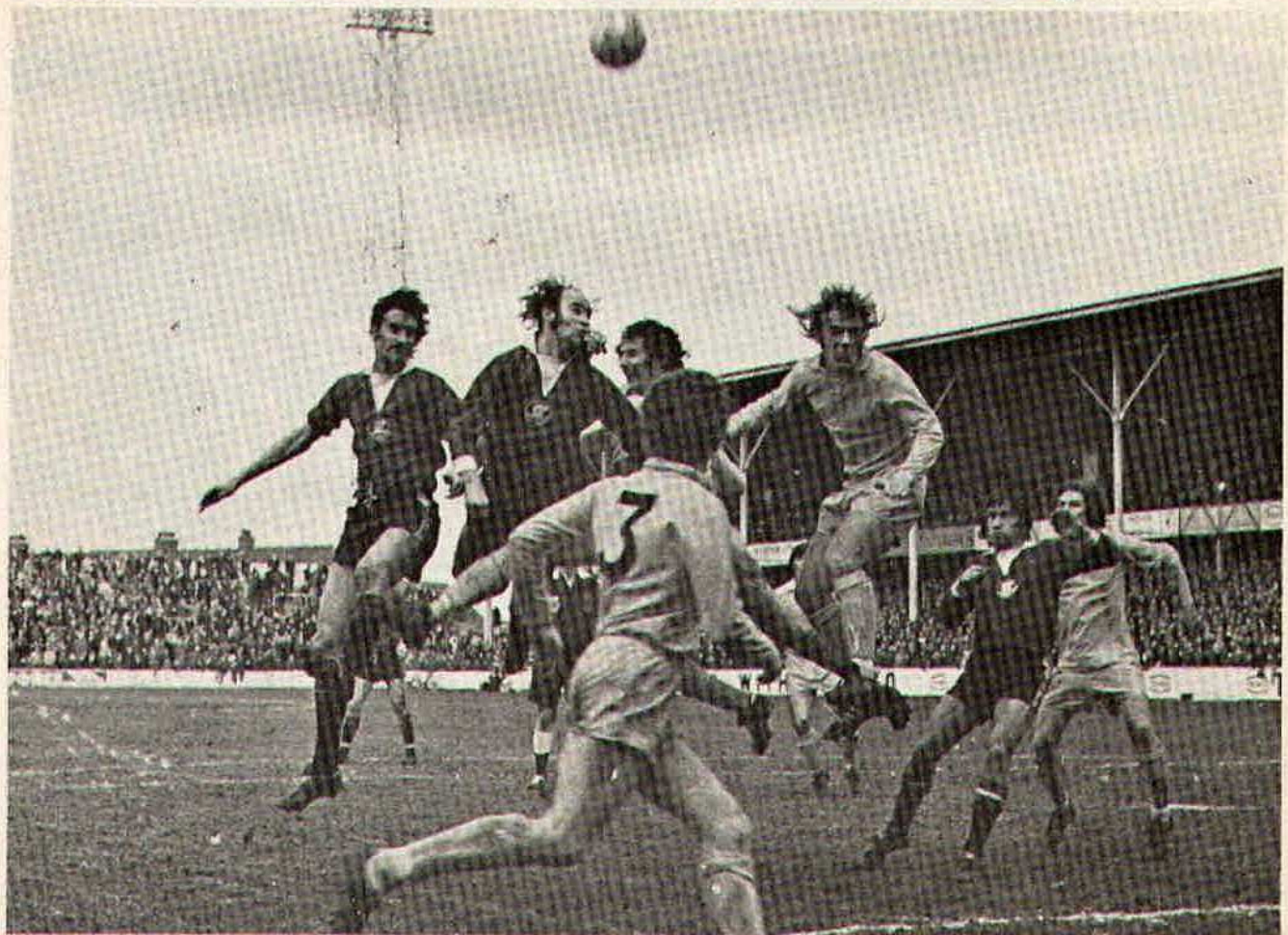
Nine players and the referee go to make up this pyramid of determined looking footballers as Swindon struggle to get back on terms with Oxford in last Saturday's local derby.